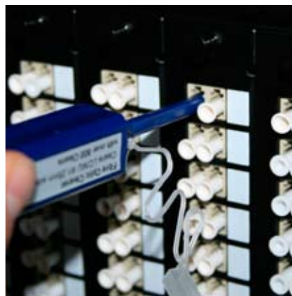
Insert the tip into the adapter