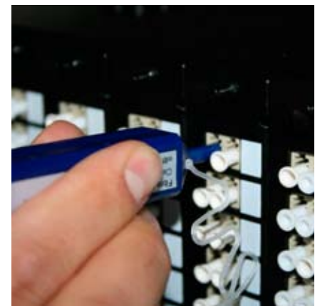
Push the outer shell to clean connector end face. A "click" indicates the end of cleaning