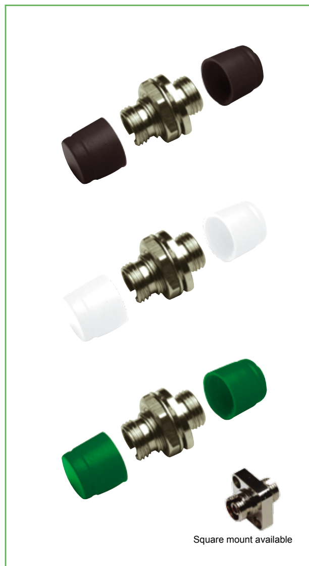
Square mount available